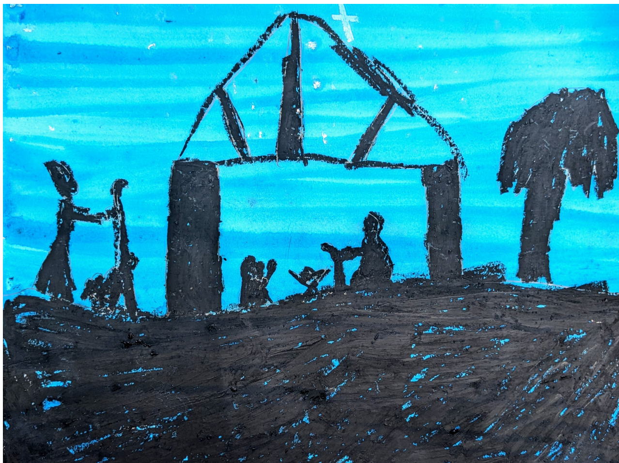
Artwork by Eden Truitt

All musical selections were reprinted with the permission of Ritesong. All rights reserved. All scripture passages are taken from the New Revised Standard Version Bible, copyright 1989, Division of Christian Education of the National Council of the Churches of Christ in the United States of America. Used by permission. All rights reserved. CCLI#351583. Some material under our license with Riteseries, Hymnal 1982, and in the public domain. Saint Paul's reserves all rights to this publication. Member of ASCAP. All rights reserved.